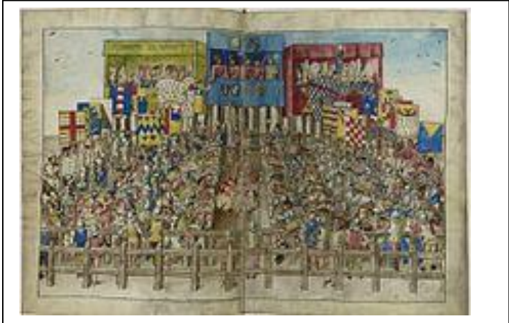
Preparing for Tournament Melee