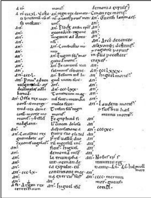
Page from "Annales Cambriae" (one version)