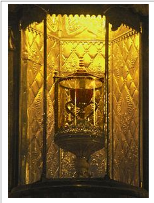
The Holy Chalice (Valencia Cathedral version)