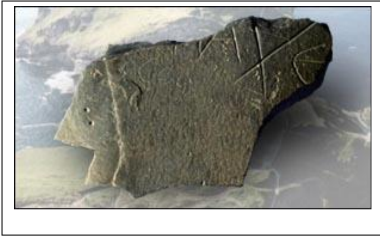
"Artognou stone" (found at Tintagel, 1998)