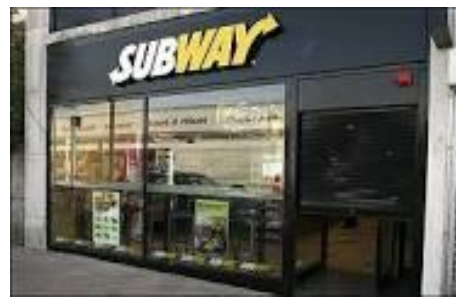
Subway store in Larkhall, near Motherwell. Spot anything unusual?