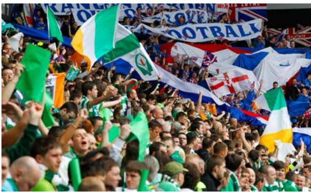
Yes, this is a Scottish football crowd, not an Irish one.