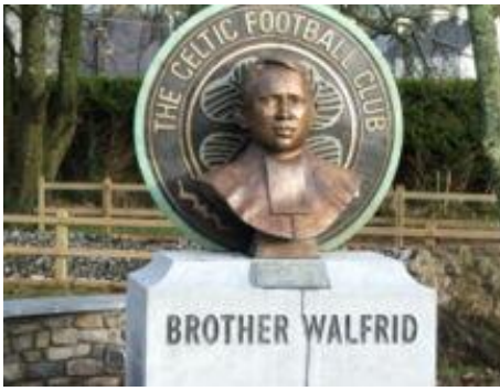
Brother Walfrid, founder of Celtic Football Club