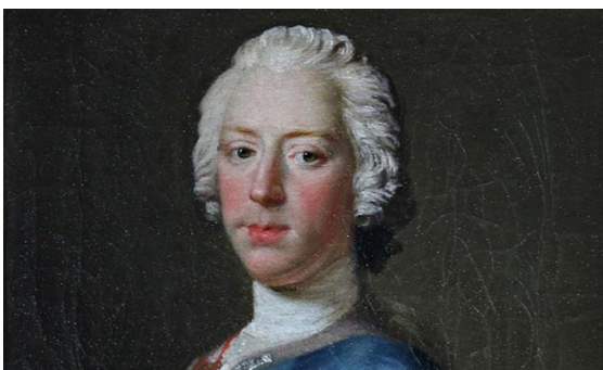
Bonnie Prince Charlie: probably the one above, not the one in the more traditional image to the right