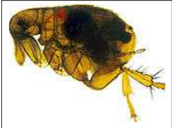
Oriental Rat Flea