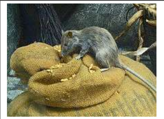
Rattus Rattus (the Black Rat)