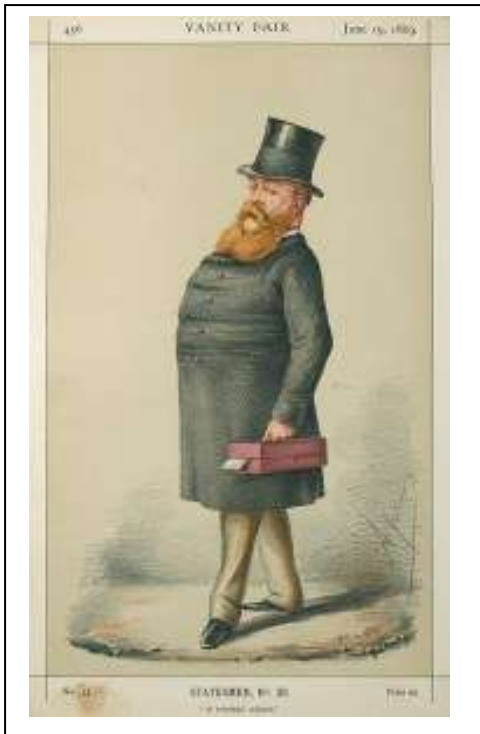
Hugh Childers, first British MP elected by secret ballot

In 1834, the Exchequer had two cart-loads of wooden tally sticks (an obsolete accounts system). The Clerk of Works ordered them burnt in two underfloor stoves in the basement of the House of Lords.