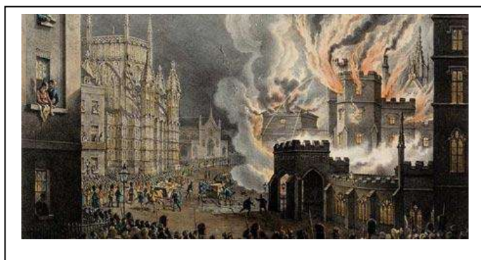
Parliament in 1834