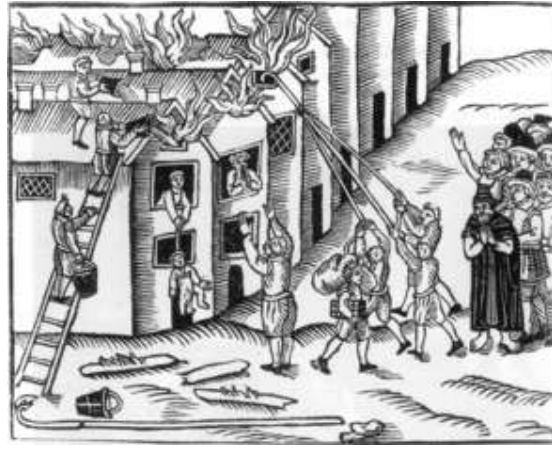
Fire-Fighting (Tiverton, 1612)