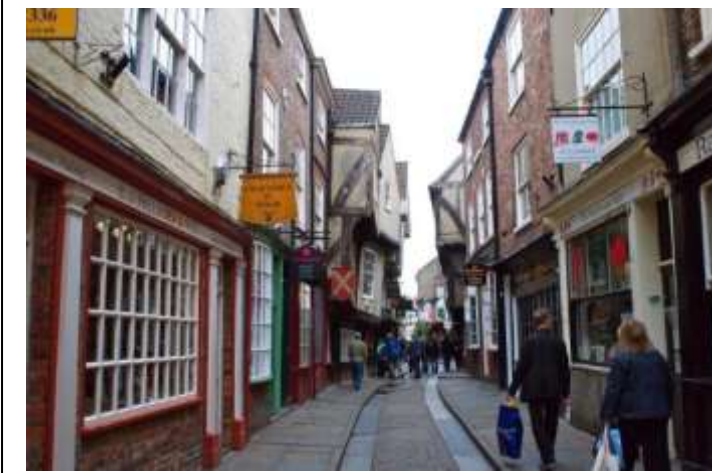
The Shambles, York