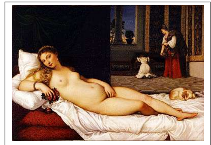
"Venus of Urbino" (Titian)