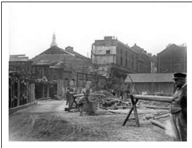
The End of Holywell St. 1902