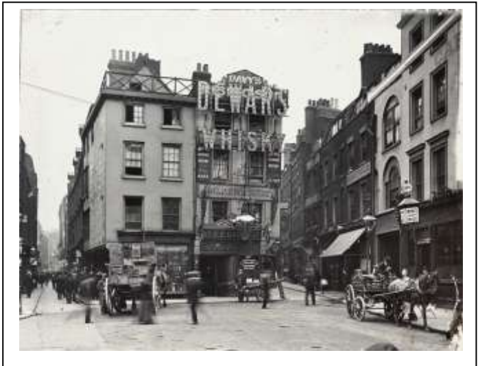
From St. Clement Dane's Church: Holywell St. to left, Wych St. to right.