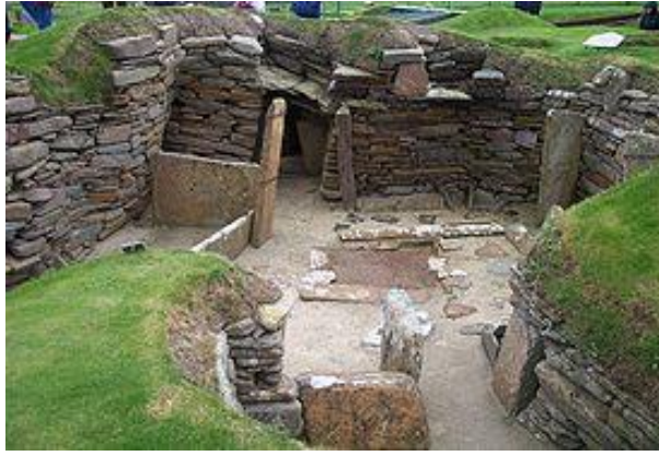
Neolithic Tomb, Skara Brae, Orkney