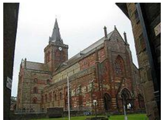
St. Magnus Cathedral, Kirkwall