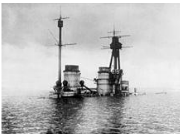
SMS Hindenburg, Scapa Flow, 1919