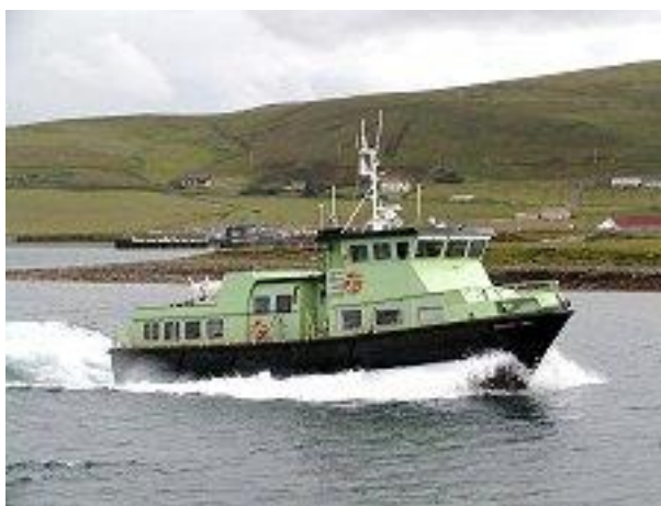
The "Works Bus", used by workers travelling to Flotta Oil Refinery