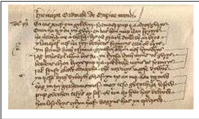
Opening verses of "Origo Mundi" in Middle Cornish (anon. 14th C. Monk)