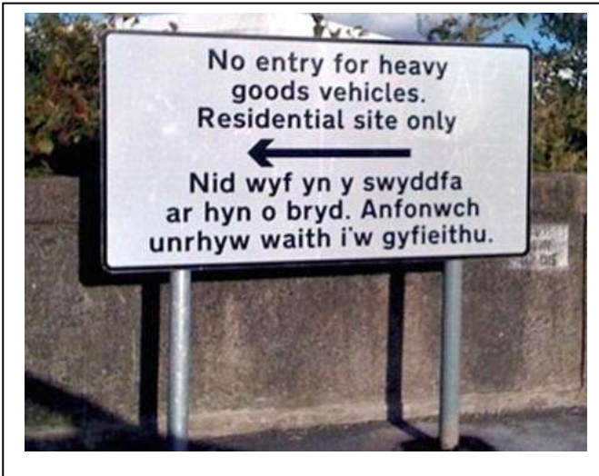
The Welsh inscription reads: 'I am not in the office at the moment. Send any work to be translated'