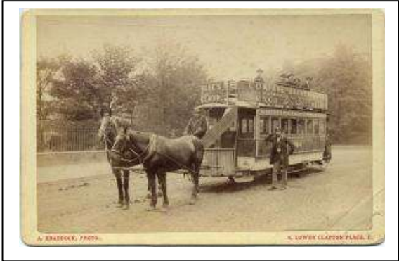
A horse tram operating on the Aldersgate Street to Clapton route, circa 1888.