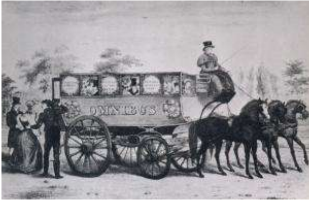
Artist's impression of George Shillibeer's Omnibus, 1829