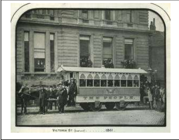
George Train's experimental horse-drawn tram, 1861