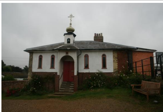
Former Railway Station, Walsingham (now St. Seraphim's Russian Orthodox Chapel)