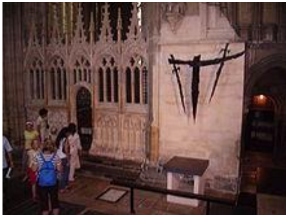
Supposed spot of Becket's killing (statue created 1986)