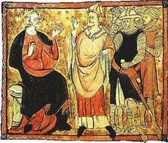
Becket and Henry II