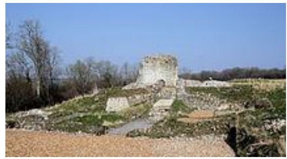
What is left of Clarendon Palace, near Salisbury