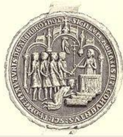
Seal of the Abbot of Arbroath