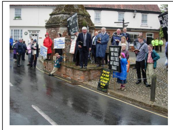
Some Walsingham Non-Pilgrims