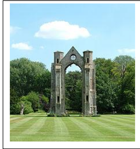
Conjectural image of Walsingham Priory, and present-day remains