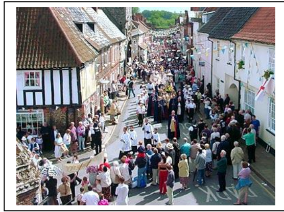
Pilgrimage Processions in Walsingham: 1931 and more recently