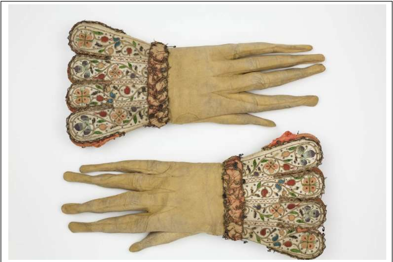
Seventeenth Century Men's Gloves