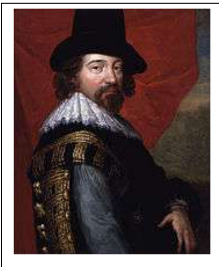
Sir Francis Bacon