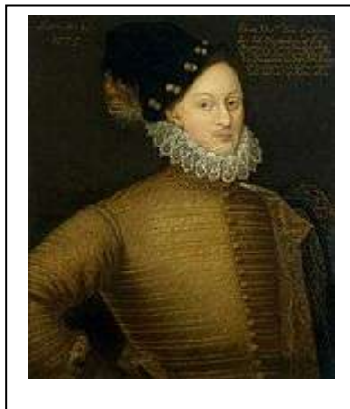
Edward de Vere, Earl of Oxford