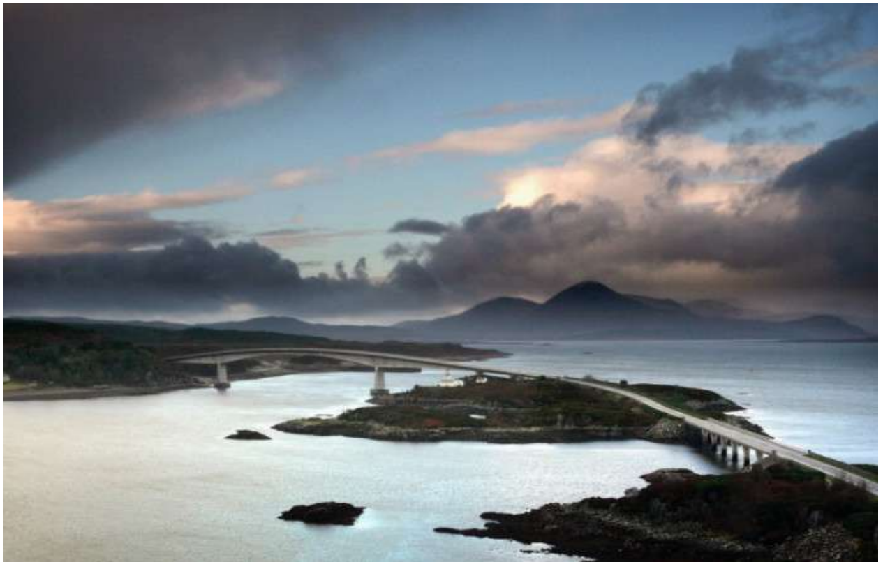
The Skye Bridge