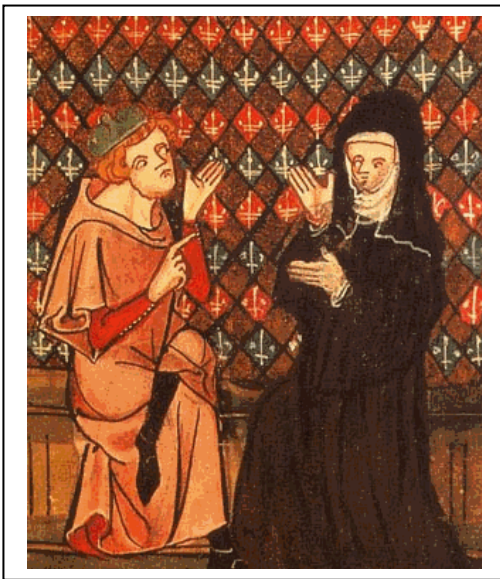
Peter Abelard and "friend"