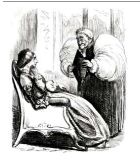
Queen Victoria: "Well, My Lord — Then I suppose my Sunday band must be given up, too" .Archbishop of Canterbury: "Oh dear no, Your Majesty! That's quite a different thing!"