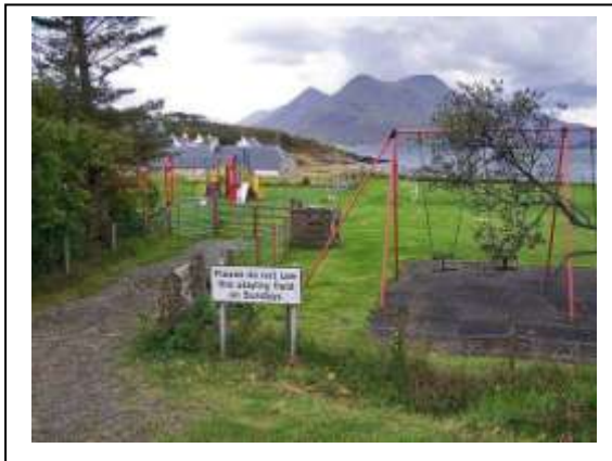
Sunday, not Fun Day, Raasay